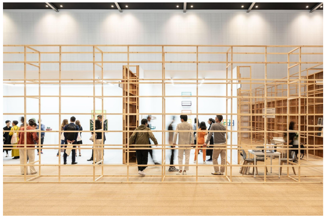
ACK Venue, 2024.

(Kyoto, Japan, June 25, 2025) – Art Collaboration Kyoto (ACK) announces the exhibitor list for its fifth edition, which will welcome the most exhibitors to date, with 72 galleries from 19 countries/regions and 28 cities, including 25 exhibitors presenting at the fair for the first time. With the support of lead partner Mitsubishi Estate Co., Ltd., ACK will take place in the Kyoto International Conference Center (ICC Kyoto) from November 14 to 16, 2025, with a preview day on November 13, 2025.